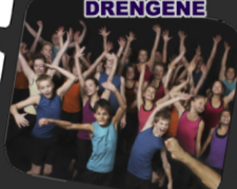
GUG ROPE SKIPPING TEAM FEAT. TRIOEN "TREQ"